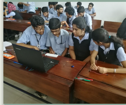
One Day Arduino Workshop 6th Nov 2017