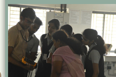
Energy Auditing Work 14th Feb 2017