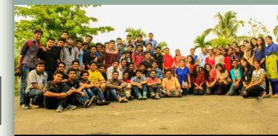
2015-19 Batch Industrial Visit