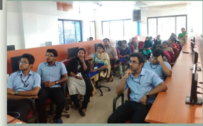
Energy Auditing Work 10th Feb 2017