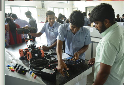
EEE Students @ Savishkar