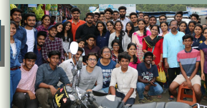
2016-20 Batch Industrial Visit