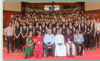
2013-17 Passout Batch