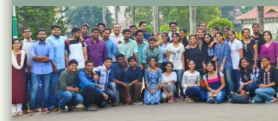
2014-18 Batch Industrial Visit